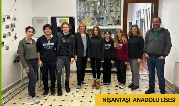
NİŞANTAŞI ANADOLU LİSESİ