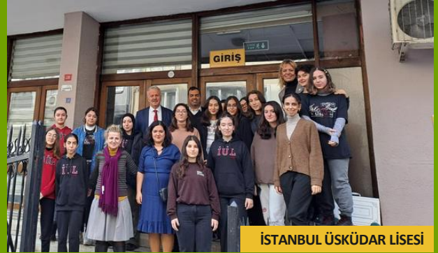
İSTANBUL ÜSKÜDAR LİSESİ