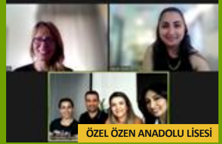
ÖZEL ÖZEN ANADOLU LİSESİ