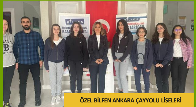
ÖZEL BİLFEN ANKARA ÇAYYOLU LİSELERİ