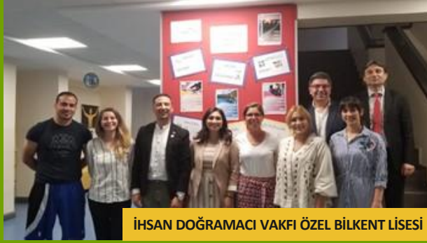
İHSAN DOĞRAMACI VAKFI ÖZEL BİLKENT LİSESİ