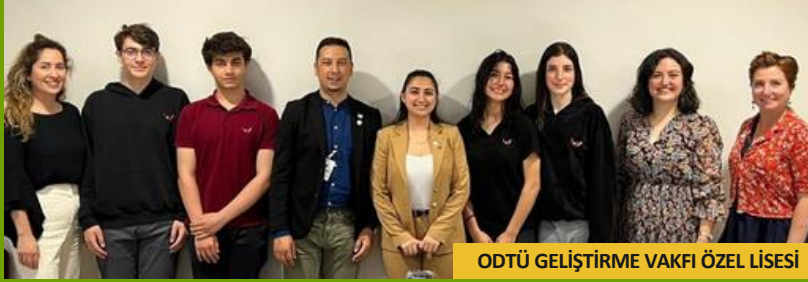
ODTÜ GELİŞTİRME VAKFI ÖZEL LİSESİ