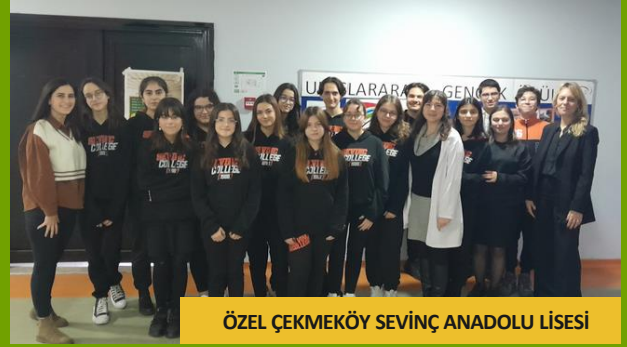
ÖZEL ÇEKMEKÖY SEVİNÇ ANADOLU LİSESİ